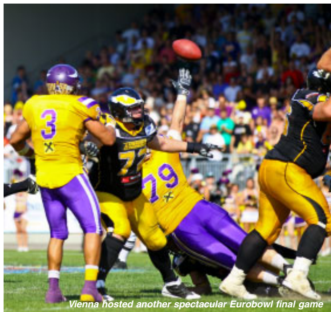
Vienna hosted another spectacular Eurobowl final game