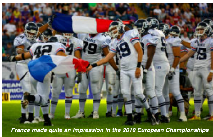
France made quite an impression in the 2010 European Championships

commence with a C-group scheduled for 2012 with Switzerland as only applicant to host the tournament. The B-group will gather in 2013 in Italy or Spain, while the next A-group tournament is scheduled for 2014. Until now there have been no applications for hosting this final tournament. The Board of Directors would like to encourage all of the federations whose national teams are part of the A-group to thoroughly evaluate the possibility to stage such an event in their country. This year's host Germany has experienced tremendous support by national and regional