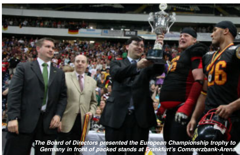
The Board of Directors presented the European Championship trophy to Germany in front of packed stands at Frankfurt's Commerzbank-Arena