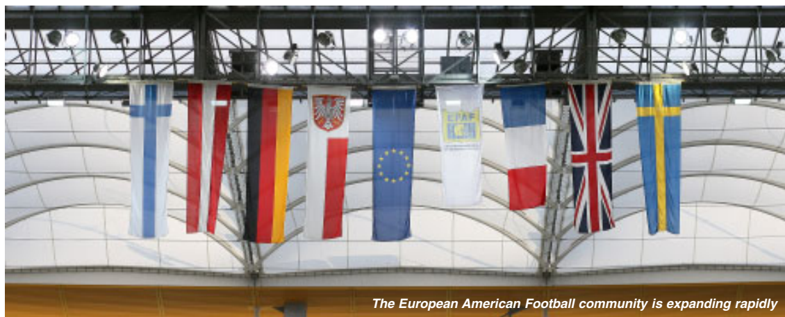
The European American Football community is expanding rapidly

The Board was informed by the president on the formal application by the Croatian federation for a full EFAF membership. Currently Croatia is one of the two countries with temporary membership in EFAF. In all American Football is played in 30 European countries registered with EFAF. 22 national federations have full membership status, in five countries the sports is regulated by EFAF Country Administrators and the Moldavian federation is an associated member of EFAF.